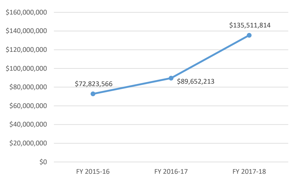
Figure 4. RIA total expenditures, as reported in the agency's Program Evaluation Report<sup>38</sup>

RIA's mission is to assist in financing qualified infrastructure projects that will protect public health, comply with environmental quality standards, and support economic opportunities. To fulfill this purpose, RIA provides deliverables (i.e., products or services) to a variety of customers. In its Program Evaluation Report, the agency provides details about its resources, deliverables, and performance measures. Figure 4 shows the agency's total expenditures for three fiscal years. As some of RIA's loans are funded through a "revolving fund" in which revenue from repaid loans is subsequently loaned back out, not all of the agency's expenditures are appropriated and authorized by the General Assembly.<sup>37</sup>