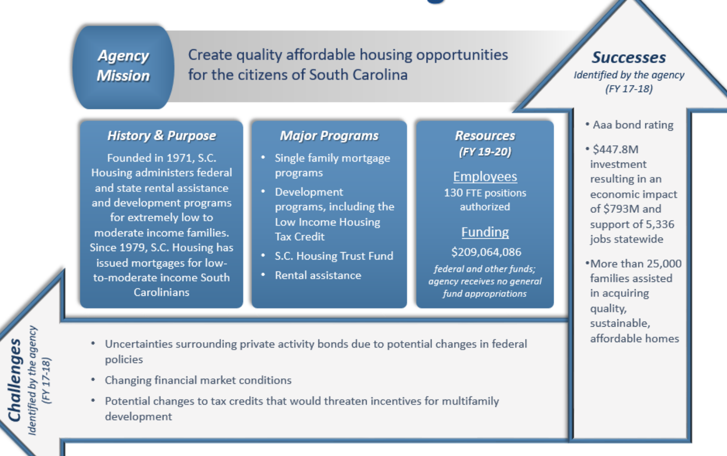
Figure 1. Snapshot of agency's mission, history and purpose, major programs, FY 2019-20 resources, successes, and challenges<sup>1</sup>