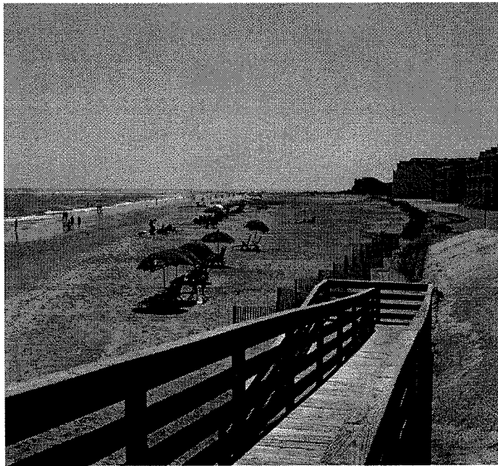
Dry sand beach restored and available for beach visitation and enjoyment. 7:30AM 8-19-2008