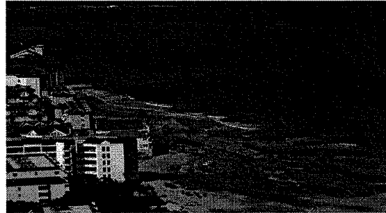
2008 Restoration Project 5-30-2008