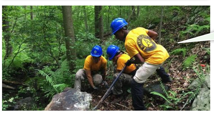
UGATA AmeriCorps members will construct 20 miles of hiking & mountain biking trails.

3 – 4 miles of new paved greenway connecting the Swamp Rabbit Trail at CU-ICAR to the extensive trail network & recreational amenities at Conestee Nature Preserve.