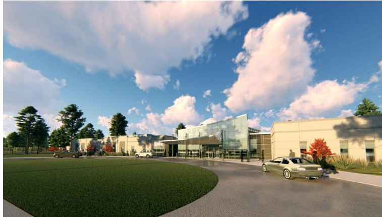
Hampton Regional Medical Center

MUSC Health Lake City / Williamsburg → opening January 2023