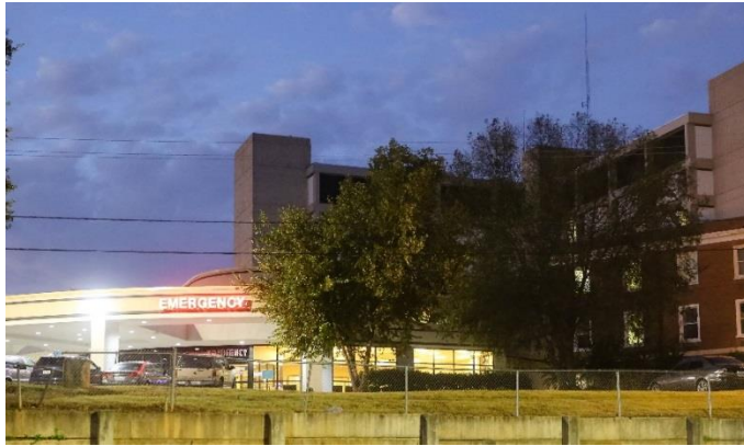
MUSC Health Lancaster