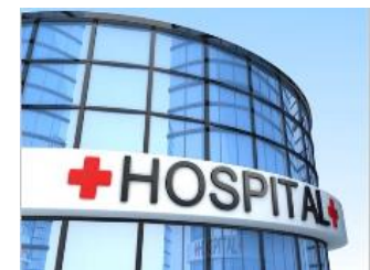
New MUSC Hospital