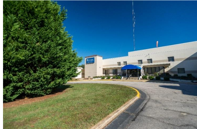
MUSC Health Chester