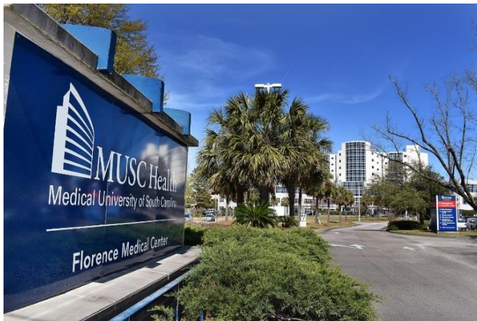
MUSC Health Florence