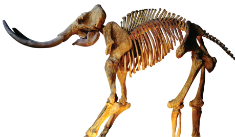
Photo by Dave Smith, 2002, mounted mammoth at The Mammoth Site, Hot Springs, South Dakota Courtesy: Unit of California Museum of Paleontology