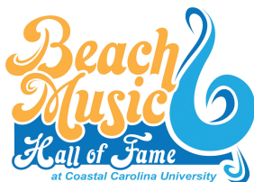
Beach Music Hall of Fame

The General Assembly by Concurrent Resolution 3960 of 2009, designated Coastal Carolina University as the official Home of the Beach Music Hall of Fame. Beach music is a type of music indigenous to South Carolina. Thousands of South Carolinians of all ages have enjoyed the sounds of beach music throughout the years, especially along the coast of South Carolina where its name was born.