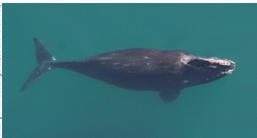
Northern Right Whale

Photo courtesy of Wildlife Trust (under permit issued by NOAA Fisheries Service)