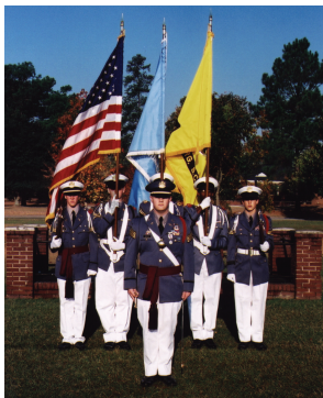
Camden Military Academy

Camden Military Academy was designated as the official State Military Academy of the State by Act No. 56 of 2001. Founded in 1958, the Academy educates boys into men of character and integrity in grades seven through twelve.