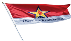
Honor and Remember Flag

The General Assembly, by Act No. 237 of 2012, designated the Honor and Remember Flag as the Official State Emblem of Service and Sacrifice by those in the United States Armed Forces who have given their lives in the line of duty.