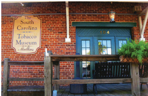
South Carolina Tobacco Museum

The General Assembly designated the South Carolina Tobacco Museum in Mullins, South Carolina as the official Tobacco Museum of the State of S.C. by Act No. 222 of 2004. The museum opened its doors in 1998 with an impressive collection of artifacts from the area and in 1999 was recognized by being presented the South Carolina Heritage Tourism Award.