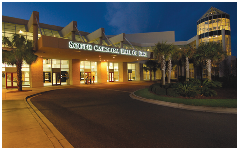
South Carolina Hall of Fame