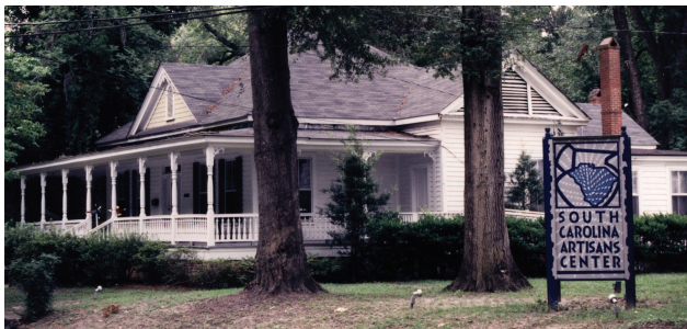
South Carolina Artisans Center

The General Assembly designated the South Carolina Artisans Center, a nonprofit organization, located in Walterboro as the official folk art and crafts center of the State of South Carolina by Act No. 256 in 2000. The Center's sole purpose is to interpret, market, preserve, and perpetuate the folk art and fine craftsmanship of South Carolina artisans, while it creates a better understanding of the rich and diverse cultural heritage of the Palmetto State.