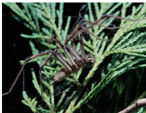
Carolina Wolf Spider

The Carolina Wolf Spider ( Hogna carolinensis ) was designated the official State Spider by Act No. 389 in 2000.