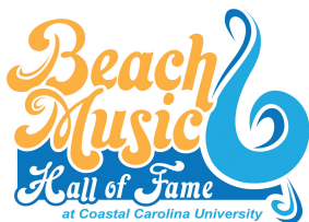
Beach Music Hall of Fame

The General Assembly by Concurrent Resolution 3960 of 2009, designated Coastal Carolina University as the official Home of the Beach Music Hall of Fame. Beach music is a type of music indigenous to South Carolina. Thousands of South Carolinians of all ages have enjoyed the sounds of beach music throughout the years, especially along the coast of South Carolina where its name was born.