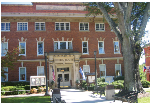
Abberville Opera House

The historic Abberville Opera House in Abberville, South Carolina was designated the official State Rural Drama Theater by Act No. 48 of 2001. The Abberville Opera House was built in 1908 and is listed on the National Register of Historic Places.