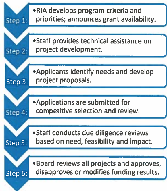
Figure 2: RIA Grant Project Selection Process

A grant agreement is issued for approved grants specifying the grant amount, the scope of the project and an 18 month grant period for completing the project. The grant agreement includes terms to ensure accountability for public funds such as financial management, audits, procurement, contracts, reports and record-keeping. The staff tracks progress and monitors all expenditures. RIA staff is assigned projects to provide technical assistance throughout the grant period.